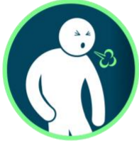
new and continuous cough

Common symptoms of coronavirus (COVID-19)